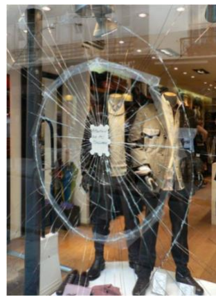
Figure 9. Broken glass imitation

On the other hand, attention management is the sphere of information security for the society. It must be considered with taking into account objectives of social groups or a whole society. If the goal is the development of society, it is important to focus on how to point the attention of every society member into constructive sphere. At the same time it is necessary to expand the scope of creative forces application of every society member. The particular attention should be paid to people who are prone to meaningless vandalism. In this case, from a variety of motives vandalism can be highlighted as a desire to relieve irritation caused by the rigidity of any project frameworks. Here we go completely into the field of design. At this stage it is important to select a style. In the architecture an irritation from a disharmony of the buildings composition made in different styles is solved with the help of modernist style. In the interior design a goal of abirritation is achieved by using bionic style. From all the potential of this style we will allocate the thesis - principles of formatting the design objects should be similar to the constructive principles of biological objects. This thesis applies not only to the shape of objects but also to the principles of objects interaction.