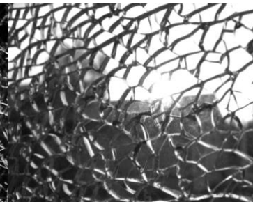
Figure 7. A grid of cracks on the hard-tempered glass