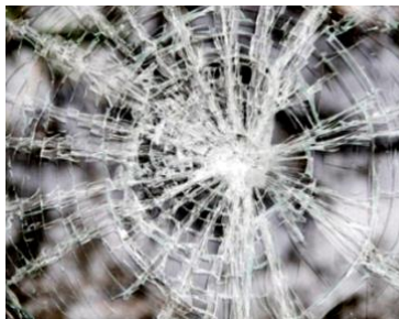
Figure 5. A grid of cracks on the non-hardened glass obtained by a hit

Considering the thesis of meaningless vandalism (maximum destruction at minimum cost) fragile materials are often exposed to destruction and the glass in this regard is out of competition. It has intensified designers to search for aesthetic forms that obtained by the glass breaking. For example, a grid of cracks on the non-hardened glass obtained by a hit (Figure 5), can simulate the really observable phenomenon - the aura around the luminaire during the passage of the rays through the tree crown (Figure 6). (Kornienko & Kukhta, 2015). A grid of cracks on the hard-tempered glass (Figure 7) can simulate a rete of streaks on the tree leaf. In both cases it turns into aesthetic form. It is complicated enough but can be obtained with one hit. It is noteworthy that an imitation of natural form has specific aesthetic value. Under certain conditions this imitation can be produced through the destruction. In this case shapes are obtained by glass breaking (vandalism) but they can be used for constructive purposes (vandal-proof).