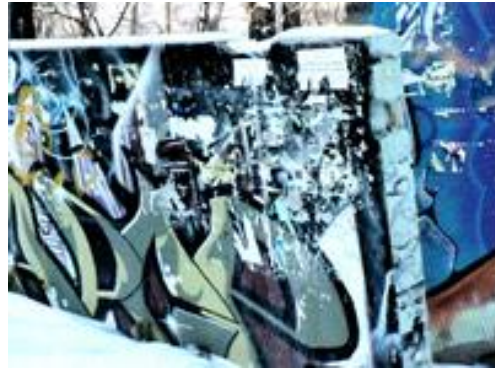
Figure 2. Vandalism among anti-vandalism

This case shows that by means of design the reduction of the meaningless vandalism results can be achieved. One of the design tools is an attention management, so the object should be designed in a way that hubs of attention could easily be restored when they were violated. In the case of fence the good design course is to put the information stand on the corner.