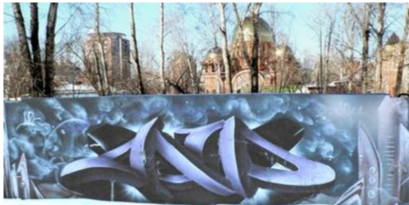
Figure 1. The example of anti-vandalism

In this case there was a need to eliminate the irritation from the monotony of the fence. There were conditions, created for realization of the motive (search for identity). The result is an aesthetically valuable object; this is an example of anti-vandalism. Spontaneously it began to appear different ads at the same place, what disrupted the available aesthetic value (Figure 2). This is a meaningless vandalism. It is notable that after graffiti, concentration of advertisements had increased in the corner joints of reinforced concrete sections. Before application that concentration was less pronounced. It has a convincing explanation. Before graffiti leaflets were visible anywhere on the surface of monotonous concrete sections. After graffiti information leaflets became visually lost in the background of pictures. Corners became the only place of attention so where newsletters are concentrated now.