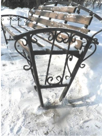
Figure 3. A bench as the object of vandalism