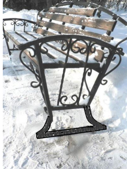
Figure 4. Form correction

Thus we can formulate a thesis of counteracting mindless vandalism by means of design. The object should be designed to eliminate the stress concentrators and to have the appearance of physical strength. On the other hand physically durable construction can on the contrary give a rise for desire to destroy it. In this case we have a meaningful vandalism and the opposition to it comes out of the design scope.