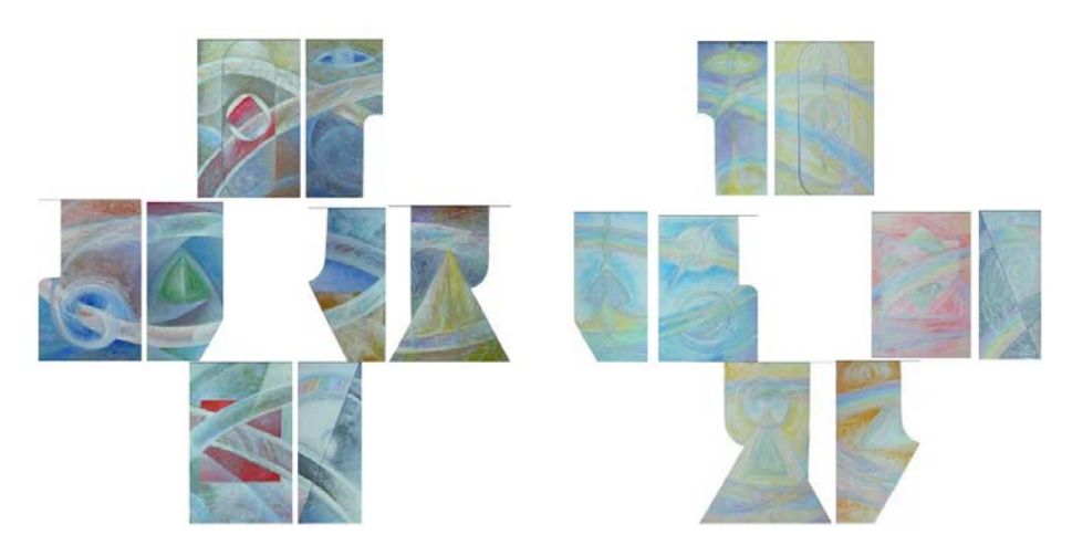
4 A – Shadows 4 B - Lights Fig. 4. (A-B) - "ENTITIES" (Compositional display options for the pieces in the Shadows and Lights hypostases)

The Universe is reflected in us - in our physical and psychic structure, in our intrinsic order and disorder - and its creation, in the rhythms, symmetries, asymmetries and everything that pulsates, appears and transforms within each human being. Resonance logic is present everywhere in the visual forms of reality and in those which make up the artistic aspects in time and space.