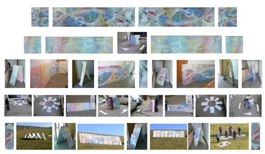
Fig. 3. Ambiental hypostases of modular painting, double-faced, CONTINUUM - Shadows and Lights. (Fronts, backs and compositions of the panels in the CONTINUUM - Shadows and Lights exhibition. The front the back of the eleven pieces ensemble = eight are correlated with the colors of the solar spectrum + white and black, the geometrical forms associated to them and the days of the week and of the Creation + Parousia. The varied display of the works gives new semantic interpretation to the new compositions.)

The Continuum presented in this paper is a double-faced compositional suggestion in itself. It has a pattern of forms and colours capable of generating other forms which, in their turn, can be assembled from these components. Almost modules, but still not identical as form, they allow for different assembling, in relation to one face or another, or with both of them at the same time. The result, that is the re-shaping, plane or space stylization, allows for natural and man-made forms. Structurally, the continuities and discontinuities of the composing forms can exist within the forms concurrently. The opening of a wing, the rhythm of a wave, the approximation of a human silhouette, a tree, a mountain, a butterfly, a cross form, a roof, a building, a boat, a book and other forms of images that could be obtained from the Continuum components show that the replacing of the direct, explicitly narrative representations, with an indirect, allusive representation highlights the symbol as a means for the life of ideas and stimulates of the perceptive and creative imagination. Thus, the symbolic configurations are not only those obtained from the concept's semantic inner structure towards the exteriorization to the receptors, but also in the other way around: from the results of the associating the elements available