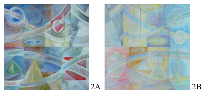
Fig. 2. (A-B) Ambiental square (Fronts 2A – Shadows; Backs 2B - Lights)

bidimensionally and tridimensionally; this extends the diversity of artistic expression. The idea is inspired from the diversity of the visual form, natural and created by human beings, spontaneous and deliberate.