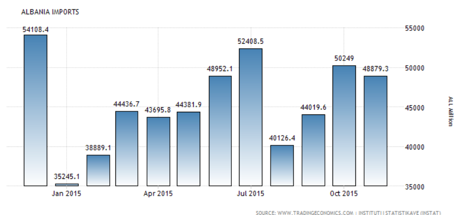
Fig. 1 Albanian imports for 2015 in ALL Million

From 1993 until 2015 in Albania imports averaged 23984.67 ALL Million. With the highest level of 59045.20 ALL Million in December of 2013 and the lowest level of 1601.39 ALL Million in March of 1997. Reported by INSTAT.