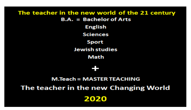
Fig. 2. A description of the training path for future teachers, towards 2020

Today Israeli teacher-training colleges have entered a new era necessitating an approach that will position the teaching discipline as a respected profession. The teacher of the future who wishes to train for work in 2020 will need to study for a Bachelor's degree in a specific discipline (e.g. mathematics, biology, English, Jewish studies, sport etc.). Only after completing this first degree, if the candidate wishes to become a teacher and is found suitable to do so, then they will be required to study for an M.Teach.