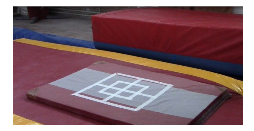
Fig. 1. Fixed point landing in the vault event

Handstand on the vault table facing the movement direction, snap down, landing at fixed point (Fig. 1) and maintaining the landing.