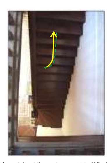
Figure 05. Staircase Taken from First Floor

Findings show that building Lot.7 staircase is located at the second hall, facing inward to the building. Hence, the three staircases are timber made winder staircases as shown at Figure 5 which is related to the Straits-Chinese identity style. Participant 24 says: "..... I consider the staircase an aesthetic element in interior design at my shop-house at the same time, the staircase show our wealth to guests because we are Straits-Chinese, with the beautifully carved with gold plated coin outline design like Ching Dynasty coin. We believe that every steps up of staircase, the money of the house will increase and again bringing the meaning of wealthiest to us." This indicates that the staircase as part of the courtyard and by extension, part of the architectural formation design components, expresses the place identity of the Straits-Chinese as well as their circulation system gradually shifts from public spaces to semi-private spaces and through the staircases to the first floor, which leads to private spaces. This agrees with Meir (2000). The author asserted that the winder is less common while the spiral staircase is the least. The three staircases buildings are timber made winder staircases.