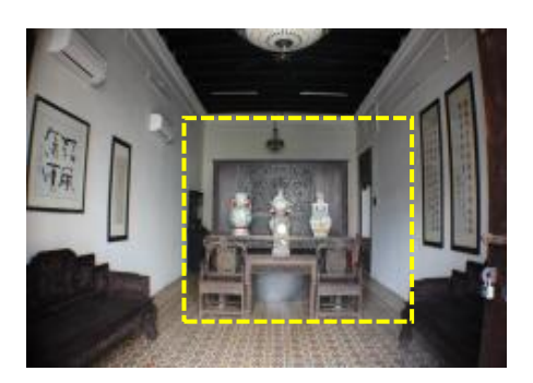
Figure 07. Vintage Straits-Chinese Screen at No.3 Shop-house

From the observation as one entrance for each building when guests to come in they obstruct the interior spaces scenery by facing a hall internal timber partition that this component exists only in Lot.5 and 7 buildings. However, there is no original internal timber partition at Lot.3 building but has a vintage Straits-Chinese screen instead of an original hall partition where the light fades as it goes deeper into the inner space. This plays an important role to provide more privacy to the family as shown in Figure 7. This agrees with Meir (2000). The author stated that the arrangement of the units provides privacy and the variation in house layouts provides a sense of uniqueness.