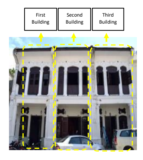
Figure 02. The Façade of the Traditional Courtyard Shop-houses No.3, 5, 7.

the surname Wong since 1926. Certainly, the cases studies of this research are a marvellous example of Straits Settlements.