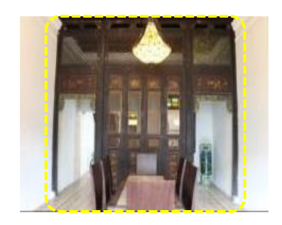
Figure 04. The Wooden Partition of (Lot. 3, 5, and 7) Shop-houses Buildings

From the observation, the wooden partitions are in Nos. 5 and 7 shop-houses as presented in Figure 4 with the exemption of building No. 3. Findings show that the wooden partitions are expression of the Straits-Chinese ( Peranakan ). This is one of the ways the Strait Chinese Participant 3 says "....wooden-screens are extremely wealthy in details and fine work surrounding the Courtyard space.... Moreover, as we are Straits-Chinese, we believe that sustaining the courtyard space feels the bliss when we are working around this building." The resultant influence is rooted in the cultural identity of the Straits-Chinese playing out in the architectural formation design components.