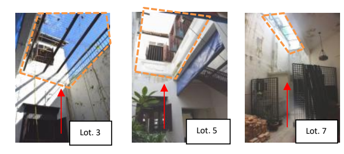
Figure 03. Air Well Centre Openings of Lot. 3, 5 and 7

we consider it the convenient space to pursuit.... As well as, we would have placed in the coolest area of our house near the courtyard." the significance of such a space was by their being situated in sites destinations within the building or urban fabric. Therefore, this agrees with Meir (2000). The author stated that Traditional Courtyard surrounded by paved and landscaped with water bodies, numerous plants, light and shade, all played important roles in the social and working life. Therefore, with regard to Figure 3, the findings show that the courtyard was developed to be climate responsive. These architectural components express the Straits-Chinese identity in the courtyard because both the materials and the design speak volume of the rebuilding place.