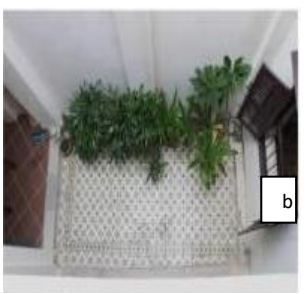
Figure 06. (a) The Water Fountain at roof garden of shop-houses No. 3 and 5 (b) Potted Plants at the Courtyard of Shop-house Lot.5

Finding shows that plants and fountain are among the significant architectural formation components in the traditional courtyard "Late-Straits" eclectic-style shop-houses that expresses rebuilding place based on cultural space. Viewpoints from Participant 14 says "The flowers trees inside my courtyard is very beautiful, symbolising happiness and unity, sent forth a delicate fragrance... always pleasant to hanging out at courtyard." This validates the findings of this paper that the traditional courtyard is rebuilding place in shop-houses. Observation shows that there are potted plants at the courtyard shop-houses Lot. 3, 5, and 7; and this makes the space greener as presented in Figure 6b. However, from the observation the courtyards shop-houses did not have the characteristics of being a garden in the old settlement areas in Georgetown, Penang. The basic reasons for this are the narrow buildings are because the tax collection guideline forced by the UK in that time. That, this agrees with Ahmad (1994). The author explained that the slim façade shop-houses which is typically below than ten meters in width is because of tax guidelines forced by the British.