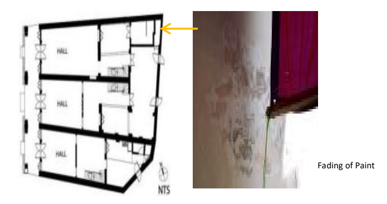
Figure 08. Locations of Defects on the Ground Floor

Finding shows that the use of traditional silicate paint is a natural mineral paint that fuses with the lime plaster finish and is a breathable material as well as resistant to ultraviolet light to sustain the wall paint (Participant 6). From observation, some of the modern silicate paints have anti-sustainable components such as acrylics which reduce breathability to a degree continued repainting will eventually reduce breathability significantly putting the masonry wall at risk. The need to sustain the natural surface of the traditional shop-houses finishes should be encouraged to express rebuilding place based on cultural space. The regulatory authorities should ensure that paint materials meet the minimum standard and this should be done at least twice in a decade with a view to preserving the walls, and by extension, keeping the heritage walls for the next generation.