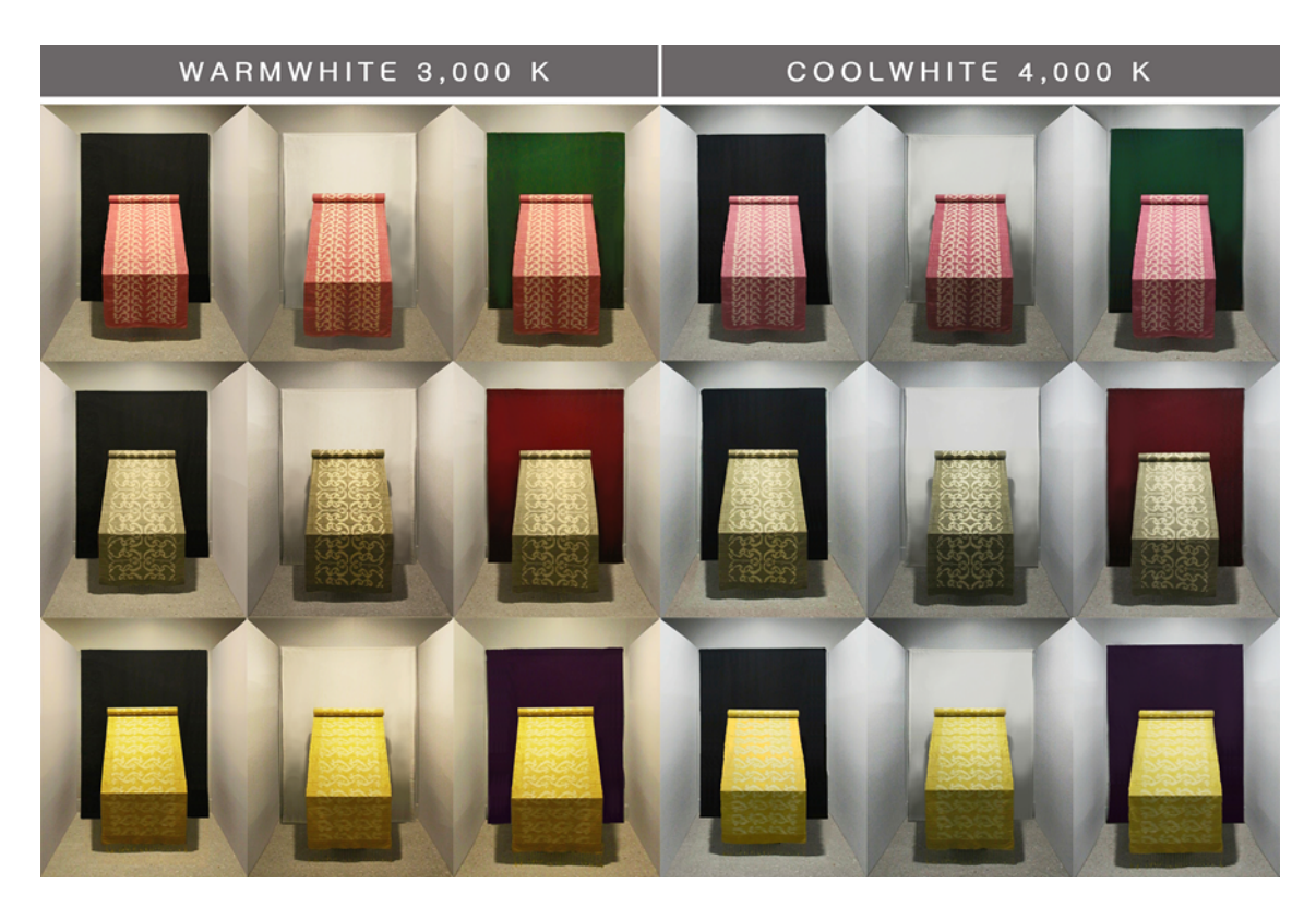
Figure 01. Six conditions of each sample fabric in the experiment

According to the SLL, this study installed luminaire which measuring the illuminance on the sample fabric approximate 50 lux. Two CCTs were chosen to be displayed in the experiment, warm white (3,000 K), and cool white (4,000 K). Each CCT was presented under three different background colors: black, white and complementary color of the fabric (Lac-red with the green background, Teak-leaf-green with the red background and Curcuma-yellow with the purple background). Pairing 2 CCTs with 3 background colors, six conditions comprised for each handwoven sample fabric are shown in Figure 1.