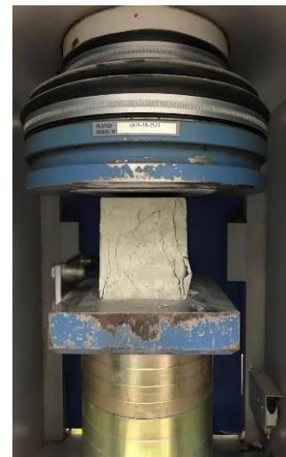
Figure 04. Concrete test