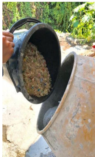
Figure 03. The making of PET concrete block