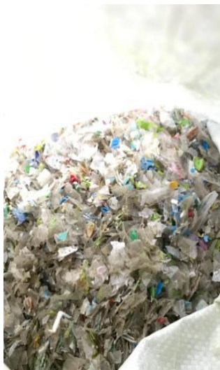
Figure 02. PET waste aggregate

This test is done with a duration of 7 days, 14 days, and 28 days of curing age. Below is Figure 4 showing the tests taken on stated days, except that the thermal properties of this block sample are only tested on day 28 using the Transient plane source technique (TPS) to analyse thermal conductivity of concrete samples.