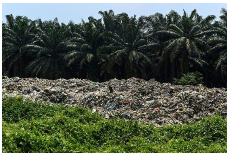
Figure 01. Accumulation of plastic waste next to palm oil trees at an uninhabited processing plant located at the outskirts of Kuala Lumpur.

After manufacturing and usage of plastic in half a decade, to date, the amount of plastic waste has risen. Since 2013, a total of 299 million tonnes of plastics have been produced and disposed of, which is a growth of 4 percent over the previous year (Global Plastic..., 2015), thereby increasing the trend of its use in previous years. In 2015, a total of 6300 million tonnes of plastic waste is calculated around the world. Likewise, it is estimated the amount of plastic waste is expected to gain a number of 12,000 million tonnes in 2050. (Geyer, Jambeck, & Law, 2017) (Figure 01).