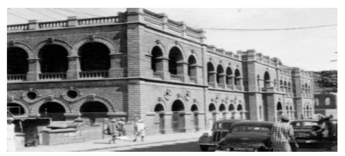
Figure 02. The Museum military building in colonial era – in Aden, Yemen

A typical colonial military museum was used to do the general review of this study with the engagement of descriptive analysis. Figure 2.