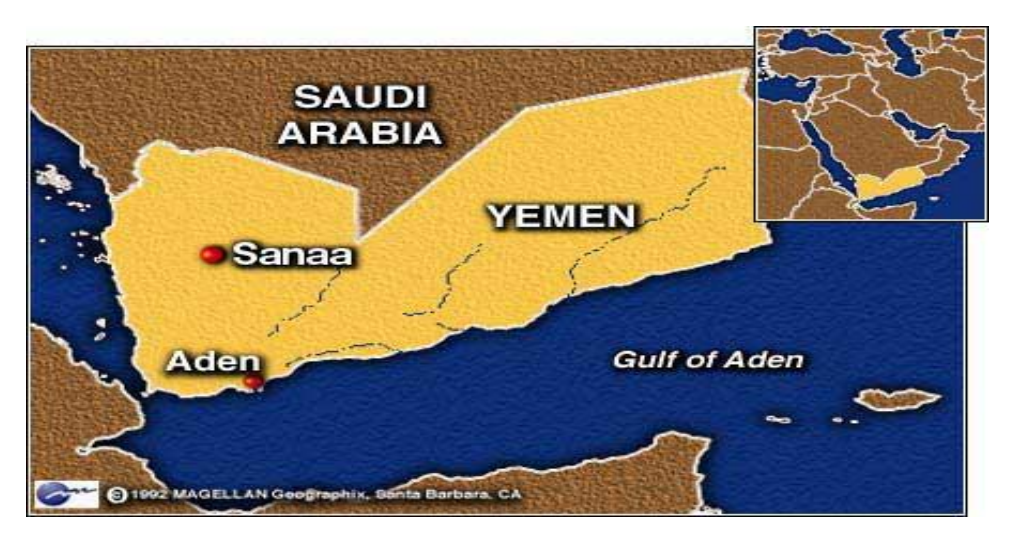
Figure 01. Location of city Aden

In the 14th century, Yemen was acknowledged for a new crop, coffee and the coffee was exported throughout Mediterranean countries. The Ottoman Turks dominated and ruled Yemen in the period of 1538 through 1635 and later retreated to the North Yemen between 1872 and 1918, while, Britain dominated and ruled South Yemen from 1832 onward as protectorate. The location of the city is shown in Figure 1.