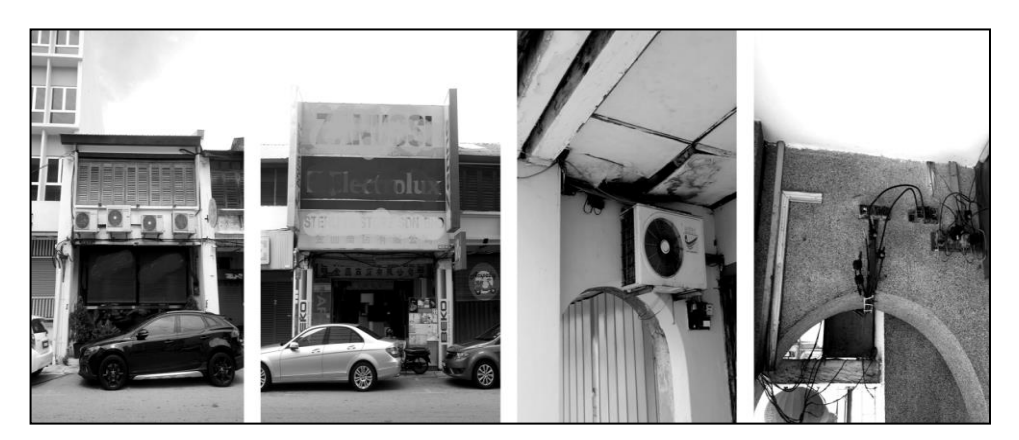
Figure 05. Samples of problems cause by modern building services

As noticed, some types of modern building services are not compatible with façade design, especially if they not installed properly, with careful consideration to the original composition of the shophouse façade. Figure 5 shows some samples of visual problems caused by the instalments of modern building services.