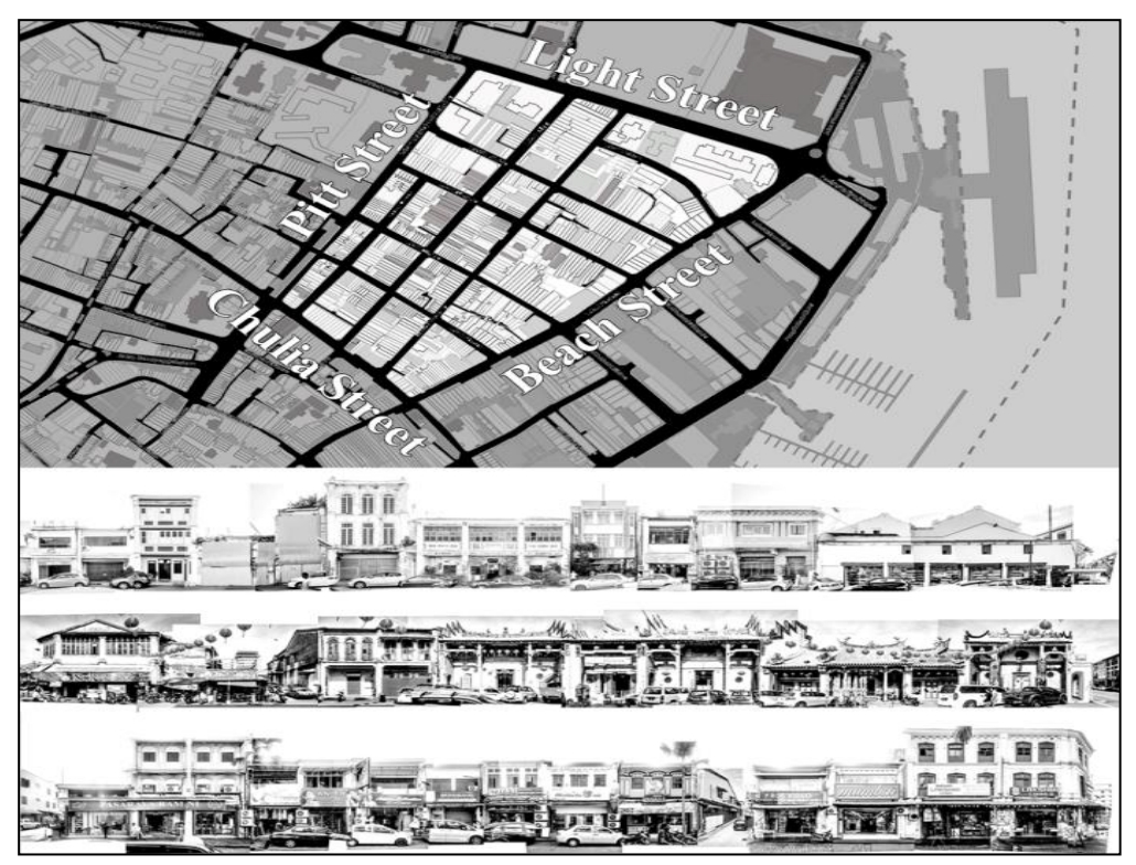
Figure 03. Case study area (George Town inner core), with samples of streets elevations

Case study area is located within George Town World Heritage Site (GTWHS), specifically the shophouse façades in the streets of the inner core area of George Town; which is the initial urban settlement planned by Captain Francis Light himself. This area bounded by Light street from the North, Beach street to the East, Chulia street South, and Pitt street to the West (Figure 3)