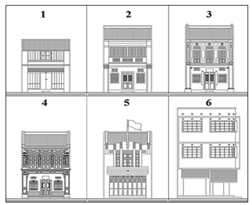
Figure 02. Penang's shophouse styles