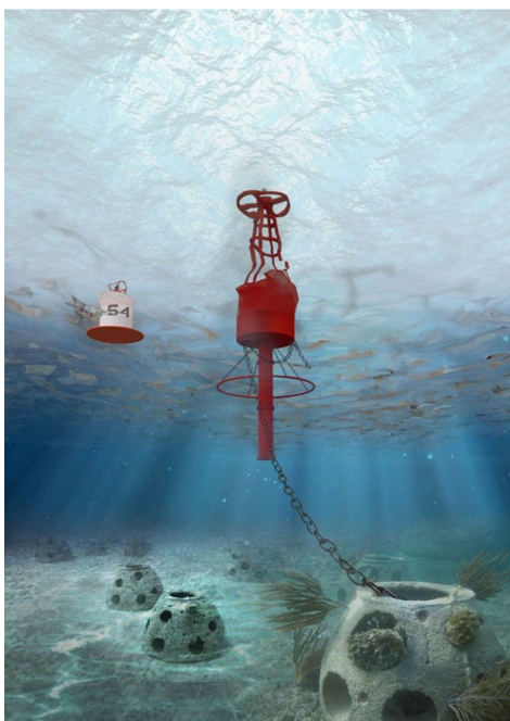
Figure 3. Scheme - visualization of a model of the "Revivalis" artificial reef in Donuzlav lake