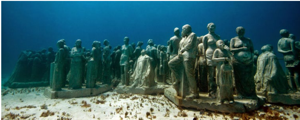
Figure 1. «Silent Evolution» by Jason de Caires. Underwater Sculpture Park in Cancun, Mexico (Taylor, n.d.)

A functional 3D model of the reef and its visualization in compliance with the necessary parameters and criteria is shown in Figure 3 with the provisional name "Revivalis".