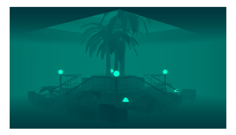
Figure 02. Islands, Non-Places, screenshot (Burton, 2020)

Softcrash (2020) is a futuristic game where technological objects created as a result of car crashes show emotional vibrations. These 'crashforms' have wild, chaotic shapes revealing an intimate connection between a human being and machines. The sculptures "elicit an affective response in the viewer"; the residue of car accidents "echoes the organic through mechanical forms". They are "part relic and part creature, inert yet imbued with a faint sense of liveliness" (Gamescenes, 2020). The Night Journey (2018) is another unique game that can been described as a videogame-enabled dream. It is a black-and-white soundscape trying to communicate something that is beyond the edge of making sense, and in order for the player to grasp it, their sanity must slip into a dreamworld.