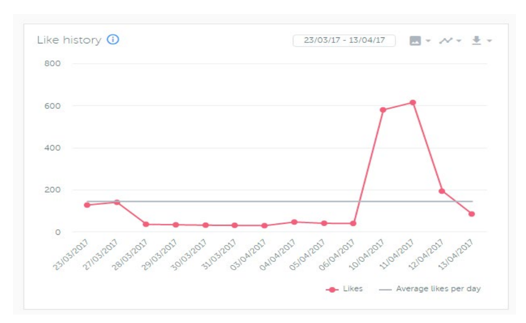
Figure 02. Indicators of likes in the official account of IWEB RUDN University in Instagram in April 2017

The cooperation with students is quite productive in matters of creation of content for social networks. It is quite capable in the end to give a significant result, which will be reflected in quantitative and qualitative communication indicators of the university's activities and its departments on various smplatforms (Gureeva, 2015). At the same time, the nature of the communications of the educational brand will correspond to the requirements and the spirit of the age.