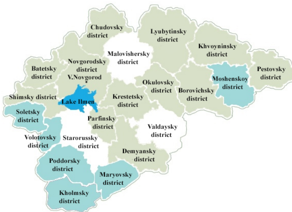
Figure 03. A cartogram of the distribution of municipalities of the Novgorod region by type of demographic environment

The calculation of the general indicator with the selection of the type of demographic environment of municipalities in accordance with the clustering made it possible to construct a cartogram of the distribution of municipalities of the Novgorod region by type of demographic environment - Figure 03 (Pritula, Davydova, & Fetisova, 2018).