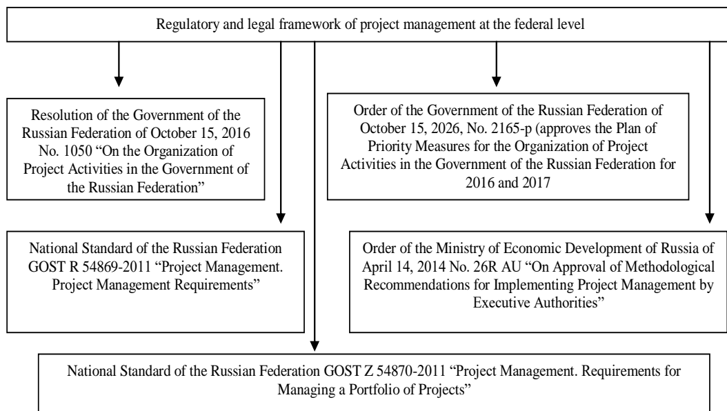
Figure 01. Legal basis for regulating project management in government

The evolution of the project approach in the field of public administration implies a transition of the management system from a process approach to result-oriented activities. The regulatory framework for project management in Russia was developed not ago.