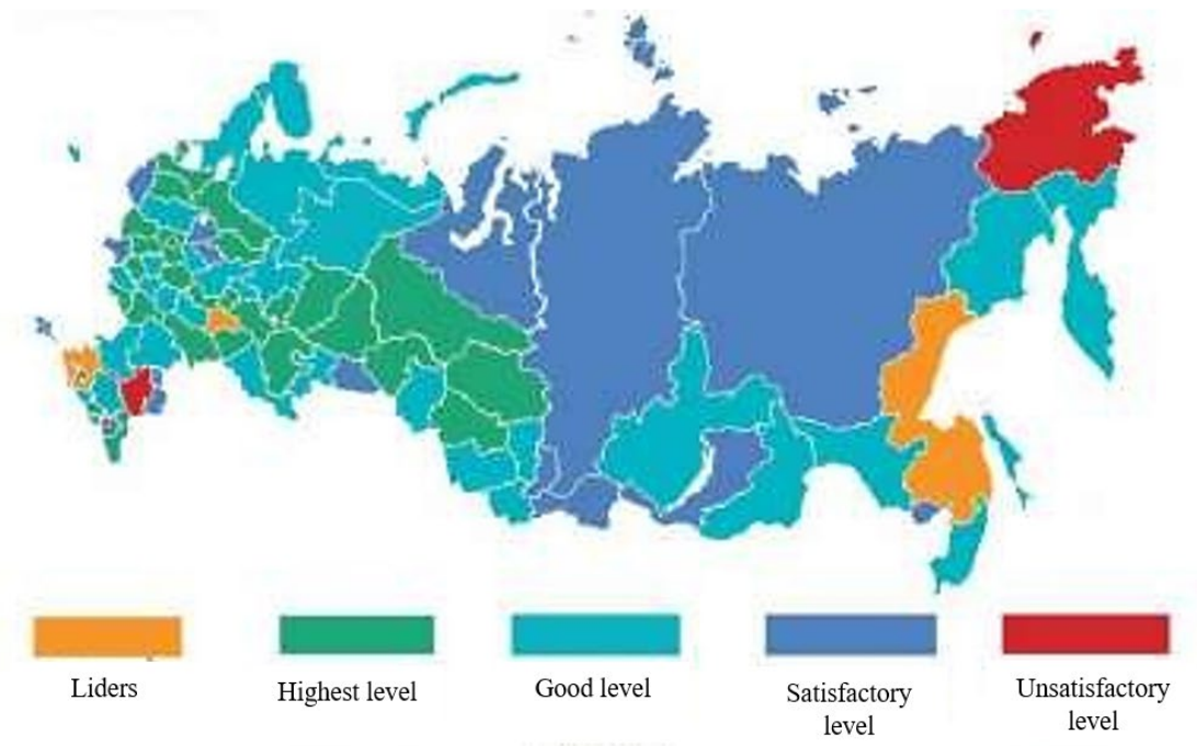
Figure 2. The assessment of the regulatory impact of regional public authorities on the integrated development of subjects

The article 26.3.2. of the above-mentioned Federal Law No. 184 (Bergener, 2012) as well as presidential decrees No. 548 of 14.11.2017 (Barasheva & Semenov, 2007) and No. 193 of 25.04.2019 approved criteria for evaluating the effectiveness of public authorities in Russian regions. However, these parameters do not include a tool for evaluating the effectiveness of regulatory impact on the economic and integrated development of the region. Evaluation of such effectiveness is currently the subject of research by the scientific community. In 2018, the specialists of the Russian National University of Economics based on their research published a report on regulatory policy in Russia (Borthnick & Vance, 2011). This among other things examines the mechanisms for evaluating the effectiveness of the regulatory impact of public authorities in Russian regions. The geographical chart of regulatory impact assessment for individual regions of the Russian Federation is shown in figure 2.