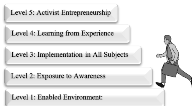
Figure 2. Five-level practical model to promote ACAP inside and outside classrooms (personal proposal)

Figure 02 below illustrates the five-level practical model for promoting ACAP to help teachers in all disciplines to understand how activist teachers should use this practical and useful model inside and outside classrooms.