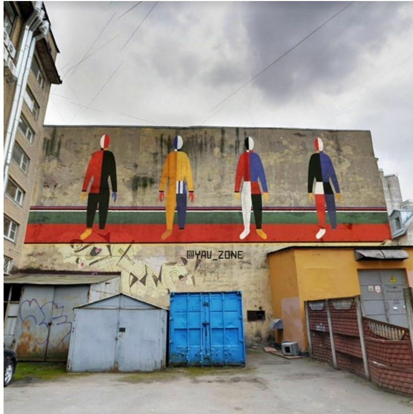
Figure 02. Online graffiti "At a distance" (exist only on Google map)